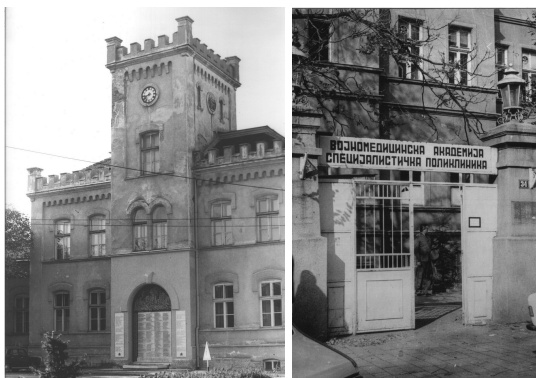
Archives of the Media Center “Odbrana” – the old building of the Military Medical Academy

Not long ago, I finished reading Thomas Carlyle's book “On Heroes”. He advocated the theory that history was created only by great personalities, and great personalities who remain remembered can only be heroes. For me, it is very real and true, it is all those who built this house, as well as those who work in it now. I am asking you, right at the be