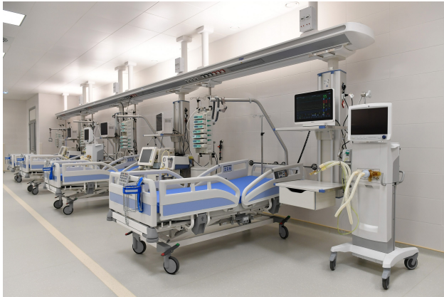
Intensive care unit

The jubilee has a special weight for me, a weight that is 18 decades old. You will admit that it is an imposing figure that dominates in its sustainability. The MMA was created with the idea of eternity, and the starting point of success is desire. All employees at the MMA have the desire to make everyday life more beautiful, it is part of our calling, and with true passion, we approach projects that continue to grow in scope even after these 180 years.