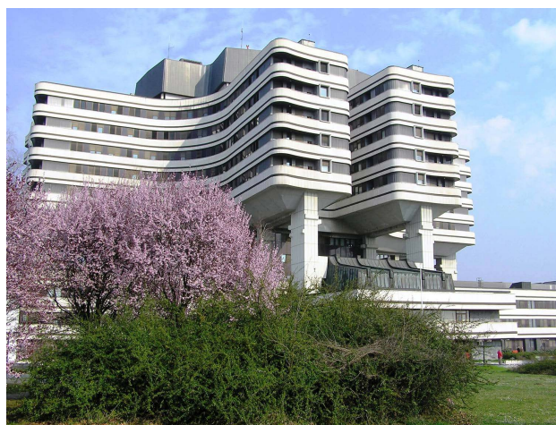
the new building of the Military Medical Academy

This year, on the eve of the birthday, each of which has so far deserved powerful words, we had a demanding task in front of us – to adequately present and mark the integrity of the MMA's existence. This institution is a symbol of the origin and development of the medical corps of Serbia and a solid foundation of not only military medicine but also Serbian medicine in general. The professional, educational, and scientific research work of generations of the best military and civilian doctors and nurses employed has been maintained and improved for decades, thus ensuring the continuity of trust of all patients and people in successful treatment, education, and quality care.