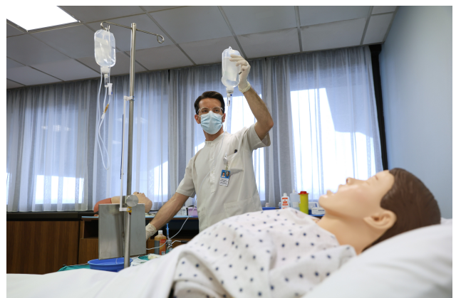
Health care service